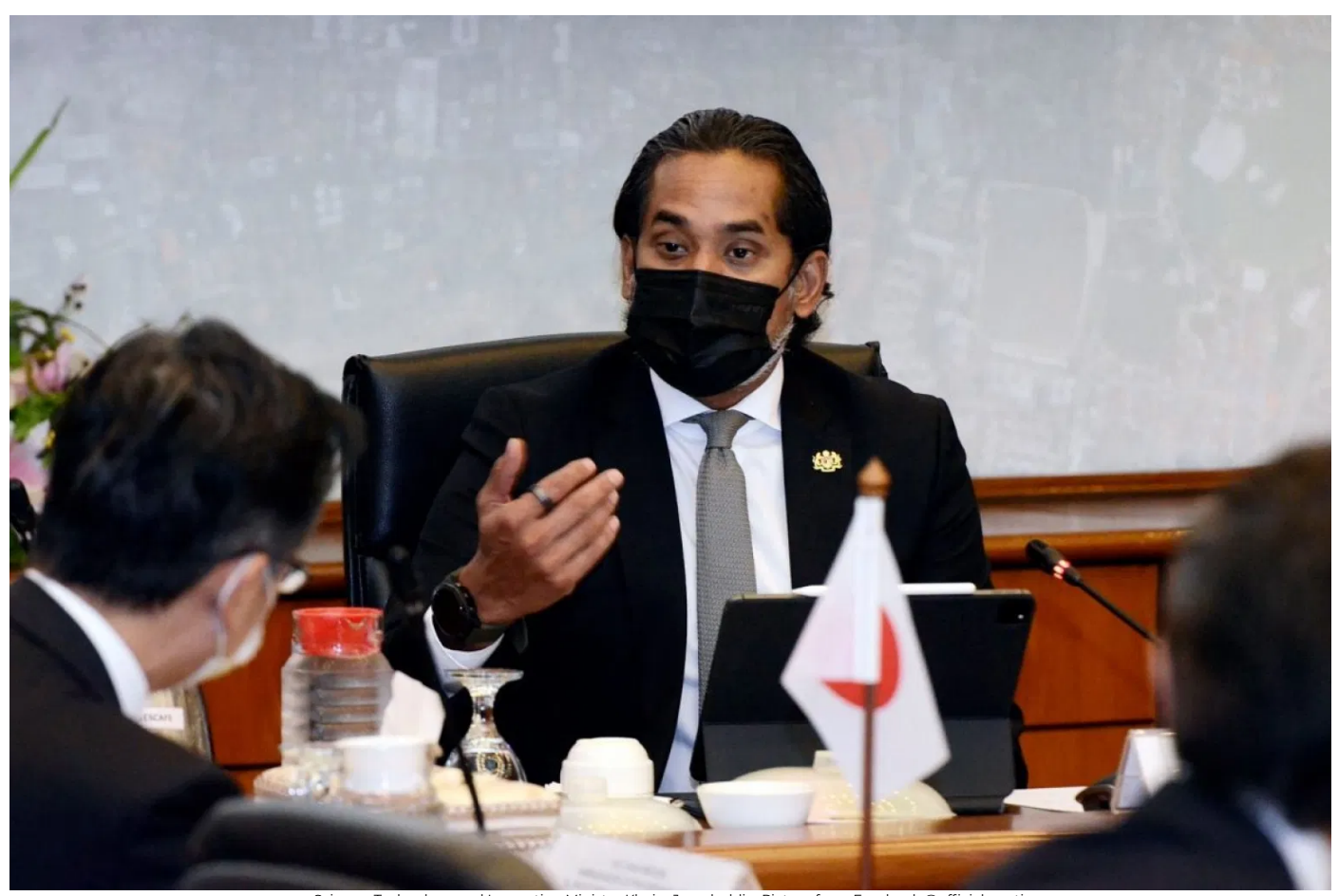
Science, Technology and Innovation Minister Khairy Jamaluddin.

Khairy Jamaluddin also says Malaysia's average daily Covid-19 vaccination rate is higher than Singapore.